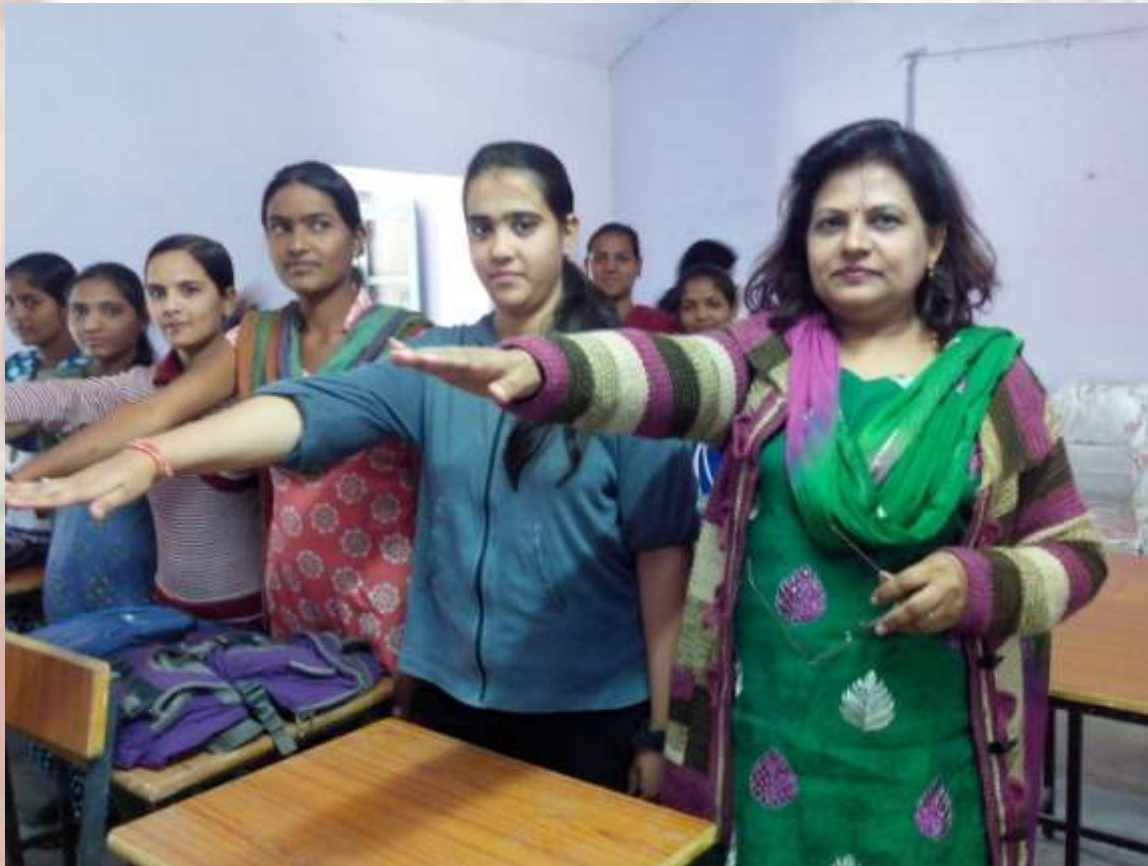
Oath taken on World Human Rights day, 10 th December 2013.