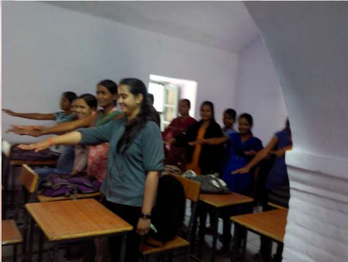
Oath taken on World Human Rights day, 10 th December 2013.